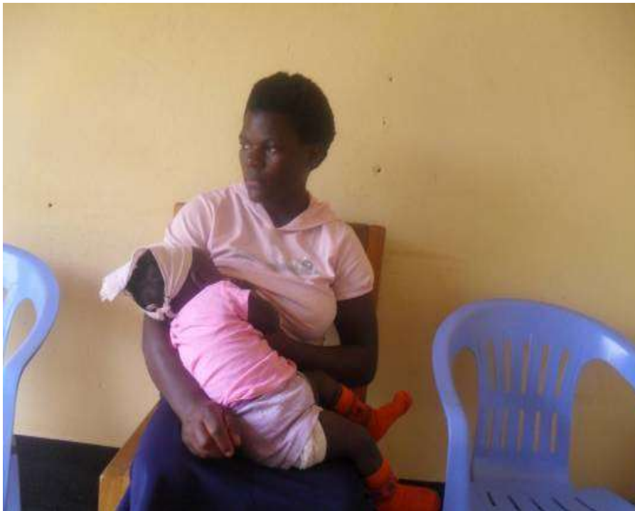
Teen mother being visited at home by CCAYEF staff