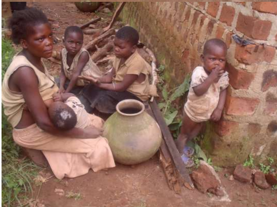
Community Mobilization towards proper Nutrition, child health& Protection